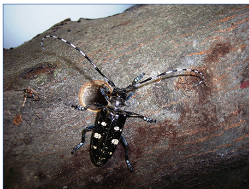
Adult beetle with exit hole.

The most important thing you can do to protect your trees is to check them regularly and encourage others to do so, too. Early detection is crucial in the fight against this invasive pest. Residents are encouraged to check their trees, report any sightings of the beetle or signs of damage that it causes, or notify the program if any trees or tree debris has been moved from their properties.