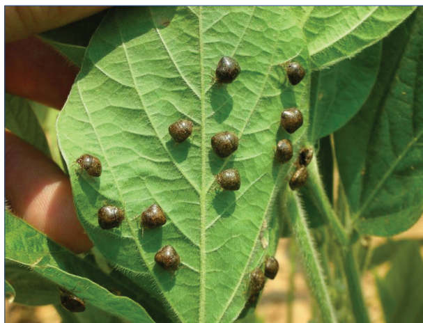
Adult kudzu bugs on soybean.

The latest issue of University of Maryland’s Home and Garden Information Center’s Hort Tips Newsletter is now available! Volume 1, Number 7 features information on new pests in Maryland’s landscape including kudzu bug and Japanese cedar longhorned