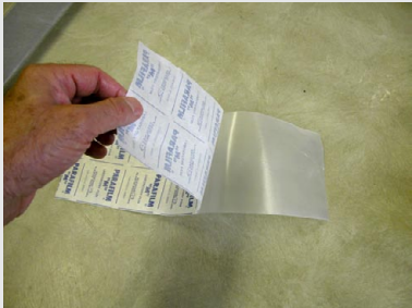
From top to bottom figures 1 - 3. Preparing Parafilm for cutting

Do the minor tasks of life get you down? Well, suck it up and get tough! Wars, poverty, injustice and corruption are running amok in the world. However, there are some minor irritations that can be solved...like cutting those hundreds of Parafilm strips you use for sealing Petri plates against creepy crawlies.