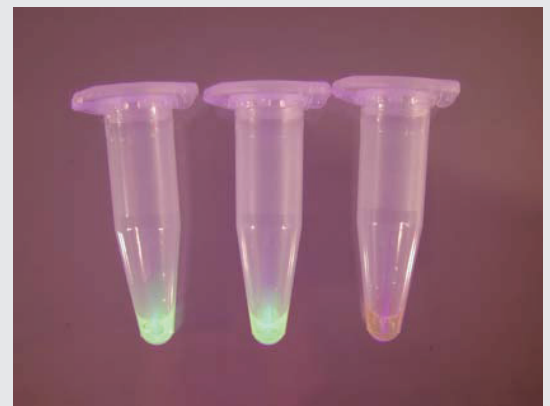
Positive LAMP reactions are shown in the two tubes on the left. The tube on the right is a negative reaction. The image was taken under UV illumination and fluorescence is due to addition of PicoGreen to all tubes.