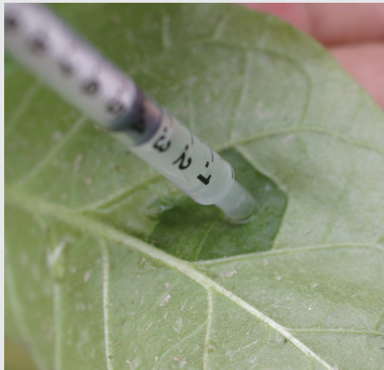
Fig. 1. Injection of a bacterial suspension through the bottom of a tobacco leaf; note the water-soaked tissue.

Prepare an aqueous suspension of the bacterium of about 10 8 -10 10 CFU/ml from a 24 to 48 hr culture. We don't actually determine the CFU's but the suspension should be turbid. Most references will suggest that you use a needle to inject the cell suspension but we find it easier to simply hold the barrel of the syringe against the bottom of the leaf as illustrated in figure 1.