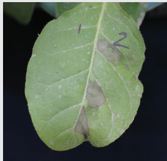
Fig. 2. Isolate "1" was tobacco hypersensitive negative and isolate "2" (three patches) was tobacco hypersensitive positive.

Turn the leaf over, bottom up, hold the needle or syringe