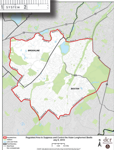
Map of the regulated area in Boston. From the Massachusetts Introduced Pest Outreach Project.