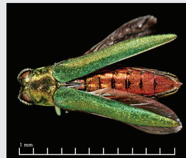
Emerald ash borer adult.