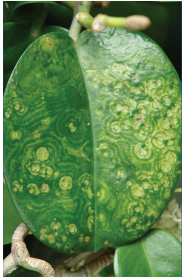
Hoyo leaf displaying symptoms of CaCV.

CaCV is transmitted by multiple species of thrips, including melon thrips, which are widespread in Hawaii.