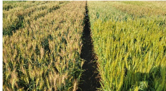
Wheat farmers in the mid-west can implement timely management decisions thanks to testing and expertise offered by the Kansas NPDN lab.