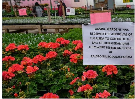
Screening for Ralstonia solanacearum, allowed the Michigan greenhouse industry to continue selling healthy plants.