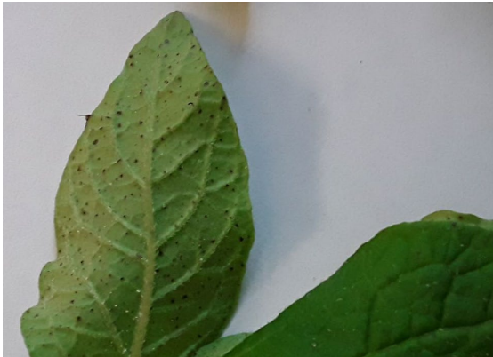
Fungicide resistance testing for potato black dot in Florida, halted disease spread by helping managers use the correct fungicide.