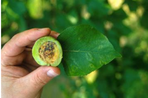
Plum pox virus was eradicated from the US in 2019 thanks to extensive survey and testing efforts supported by NPDN labs in several states.